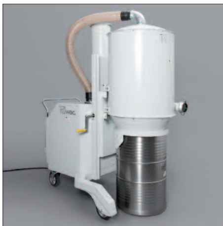
200 litre drum